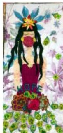
Dayle's Masked Lady