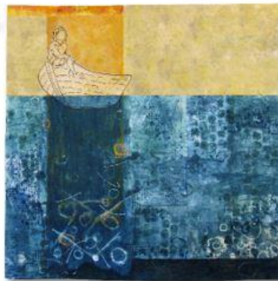
Above: “ Adrift ” Right: “Overlooked”