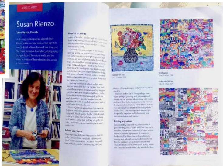
Right: Article in Art Quilt Quarterly

Karol Kusmaul was invited to present four segments for QATV: