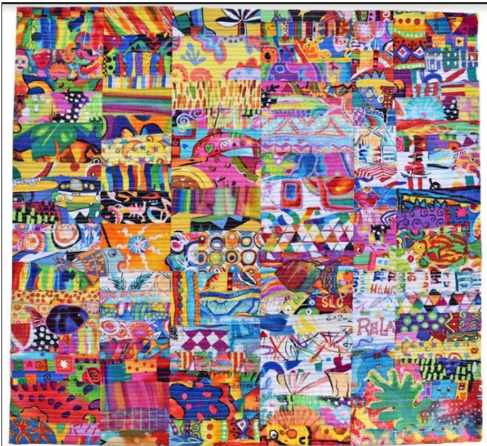
Above: “Heat Wave”