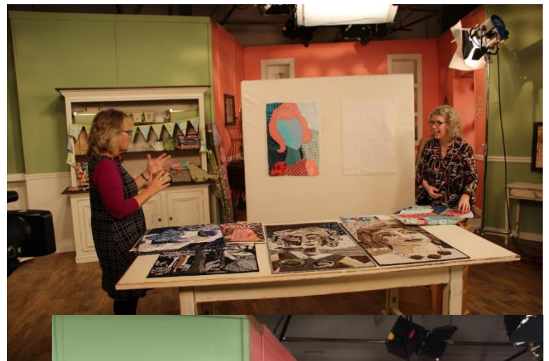
Above: The “Cloth in Common” segment