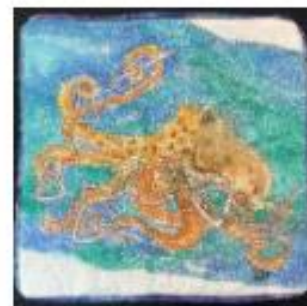
Octopus fish playing triangles