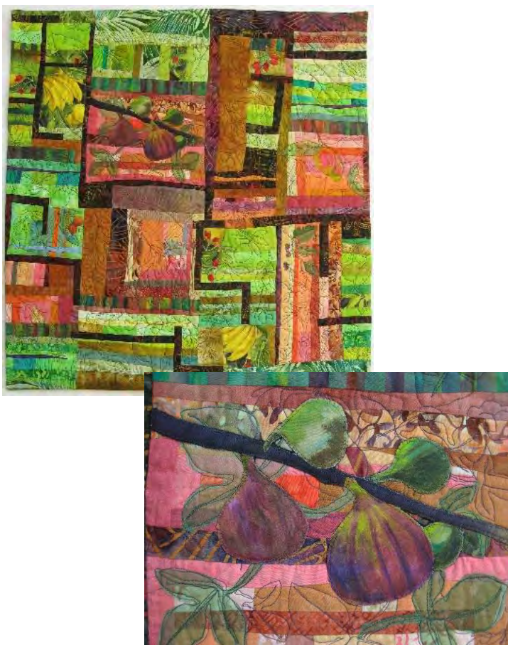
If the Garden of Eden Was a Maze (Detail below)

The exhibit runs from May 10 – July 6, 2021 at the Marco Island Art Center, 1010 Winterberry Dr., Marco Island, FL 34145.