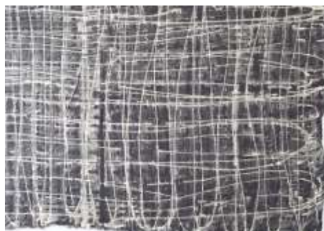
Erica Dodge Before and After