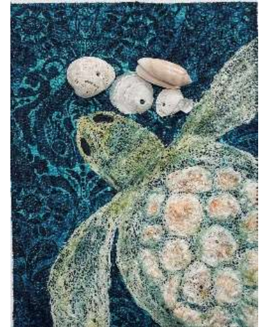
Right: Ellen's felted vest, Carol's Turtle