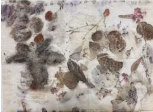
Pod 2 Round Robin Becky Stack - Before and After