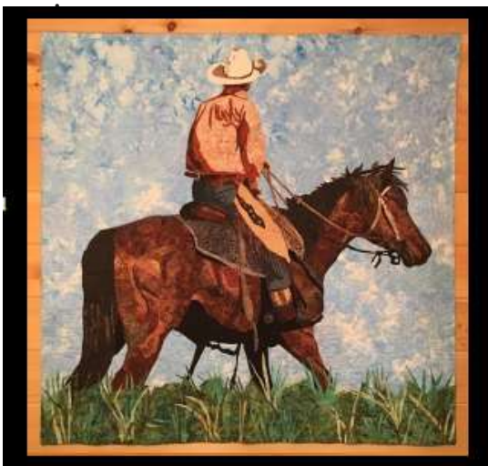
Cracker Pony and Rider Sue Robinson

Pod 5's next Play Day will be on February 13 at 12:30pm. Pod 5's next official meeting is on March 13 at 12:30pm