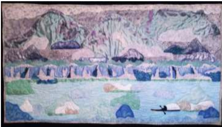
TOP LEFT Landscapes 2021 Online Exhibit Kayaking the Alaskan Glacier Las Laguna Art Gallery