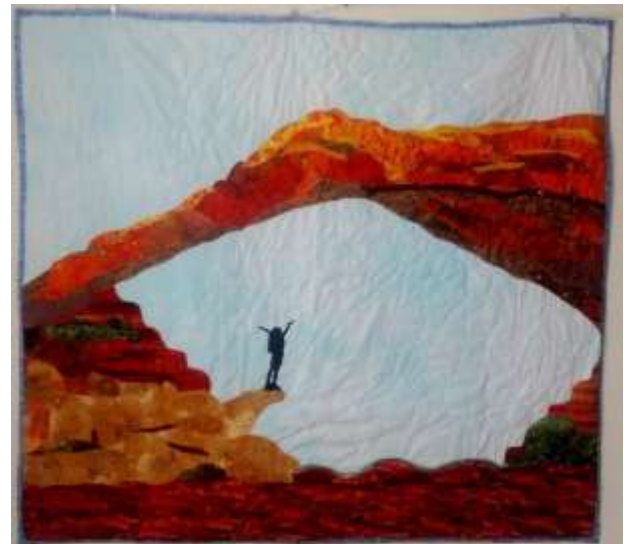
ABOVE 10th Annual International "All Women" Online Art Competition - Special Recognition - Tribute to Arches National Park Juried by Chris Hoffmann LightSpaceTime.Art Gallery