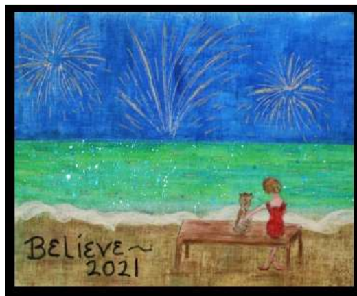
2021 Card Ann Cofone