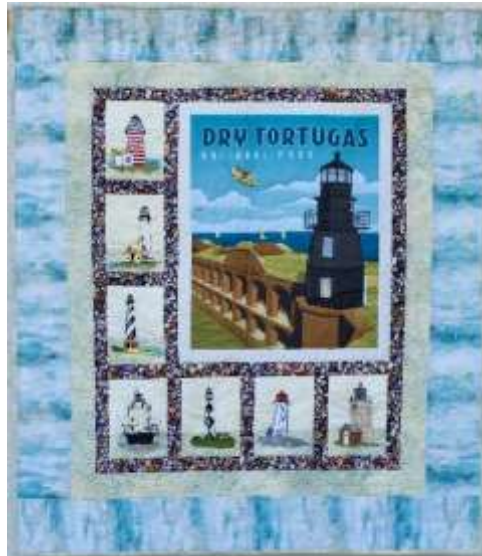
Two works by Erica Dodge