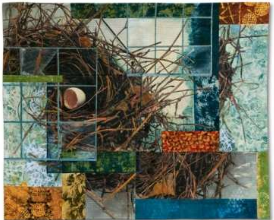
Because That's Where it All Begins Storytelling quilt – by Bobbi Baugh

Artistic purpose, finding your voice, working in series, intentional choices, avoiding the seduction of a photograph, digging deeper.