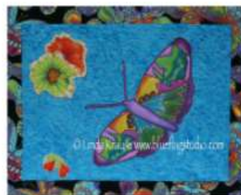
Quilt using Inktense drawing

August 21, 2021 12:30-3:30 120 NW 2nd Ave High Springs, FL 32643 $45 fee includes registration & kit (payment required to reserve your seat)