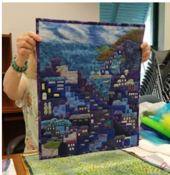
Village Jan Lipsky