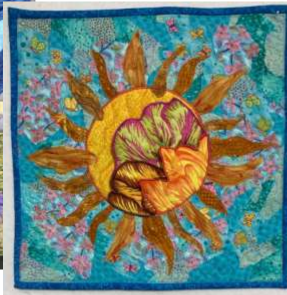
Sun Quilt Becky Stack