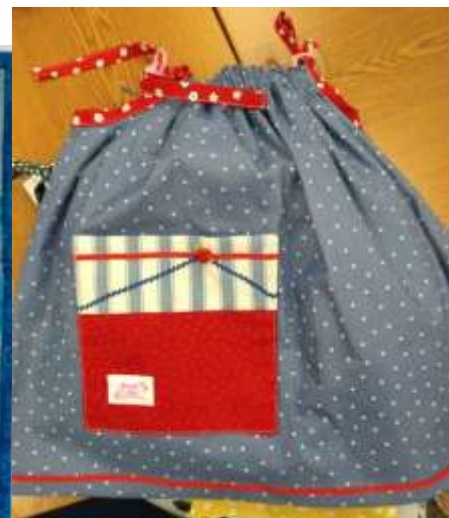
Cindy Bennett shows a dress from Dress A Girl Around the World