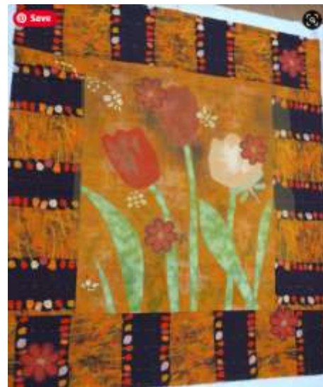
round robin project in progress – Karen Kimmel