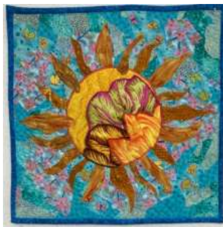
Becky Stack Sunshine in the Garden