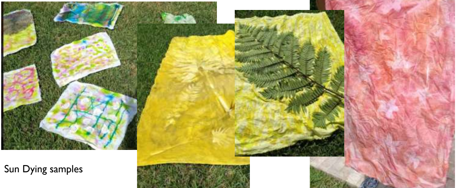
Sun Dying samples