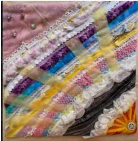
Linda Sabin The Storm is Over