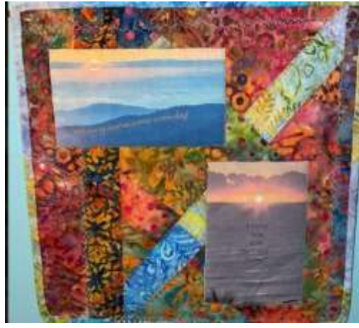
Sandra Overstake Sun Quilt