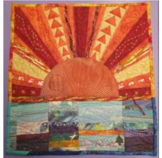
Lauren Hemkee Sunlight