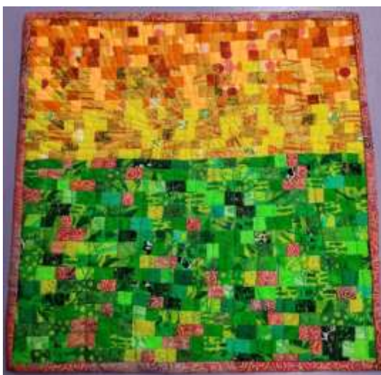
Left Erica Dodge Sunshine on my Shoulder