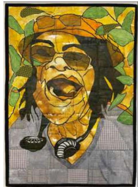
(Right) Dance Through Life 18 x 13". Acrylic and fabric on a quilted panel. She writes, "This is a fun walking friend of mine."

Pod 3S Our next zoom meeting will take place on Apr 13, 2022 from 7-9pm topic: Do you have a website/Social media to promote/share your work?