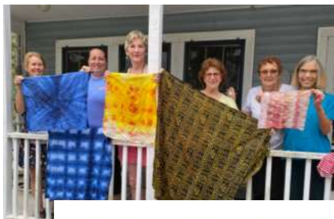
Above and Left: meeting at "The Barn"