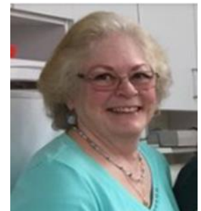
EXHIBIT PROMOS ON FLORIDA CRAFTART’S SOCIAL MEDIA

All of the quilts are in an album on the FCA Facebook page. People can vote for their favorite quilt by pressing “Like.” People can also vote in the gallery. At the end of the exhibit, we will award the winners with a gift card to the gallery. Please encourage SAQA members to vote and ask their friends to do so also. Here is the link: https://www.facebook.com/media/set/?set=a.466965131817342&type=3