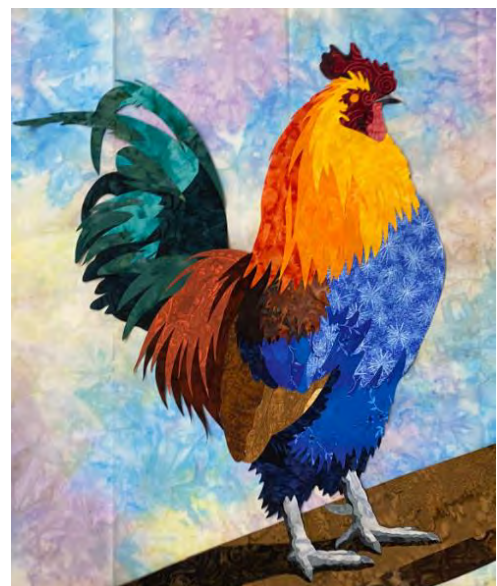
Kestrel Michaud: Rooster from an online class she is teaching