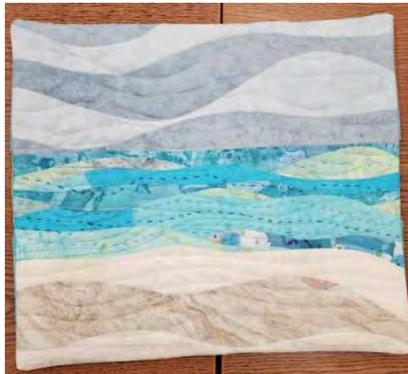
Sarah Squires - Landscape