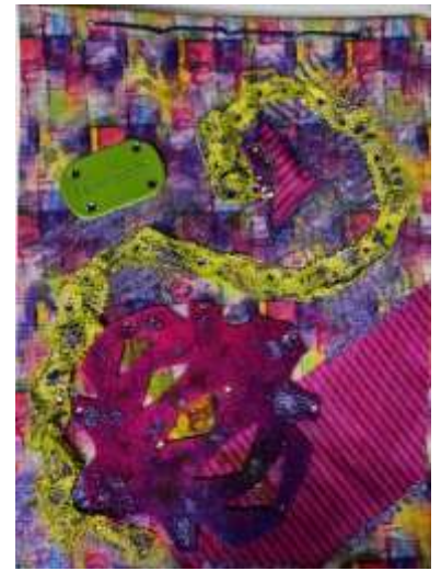
Rhoda Newton Journal Cover