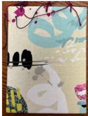
Adele Rivers Journal Cover