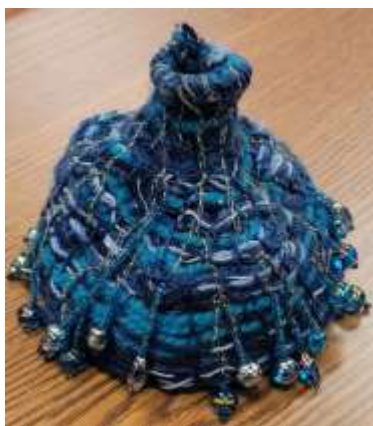
Robbin Neff, Coil and Embroidery Vessel, Family Tree, Organic