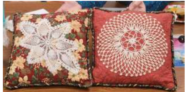
Becky Stack - Mom's Vintage Dollies Pillow