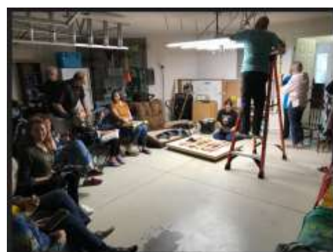
Photo Day in 2020. Members socialize while Kestrel's Dad adjusts lights

Please fill out this RSVP form if you plan to attend so Kestrel has an idea of how many people and quilts to expect: https://forms.gle/qfQaEaAQX5RWVLqE7