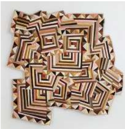
Americana Quilt 34, 2020