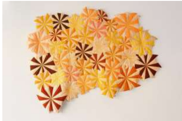
Pieced Landscape 7 (Annatto 4), 2022, 72 x 90 in