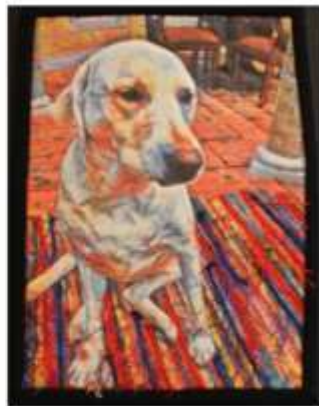
Dillon R. Celeste Beck