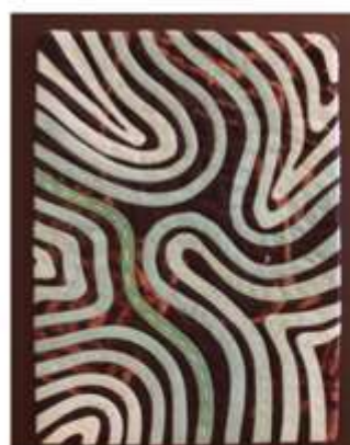
Squiggle #1 Jann Warfield