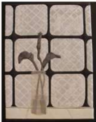
Bloom in the Window Ellen Simon

WHY: Donations will support future SAQA Fla activities.