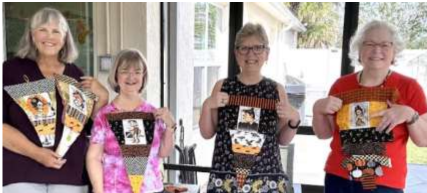
Pod 3N members are ready for Halloween with banners and more!