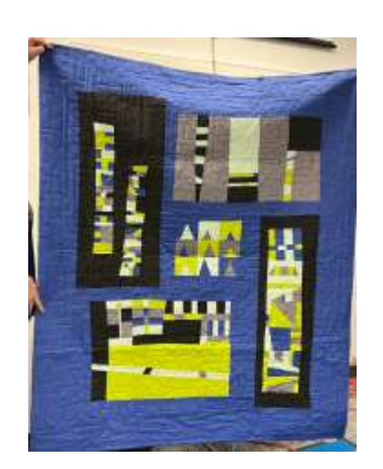
Robbie Knapik "It was supposed to be a quilt back"