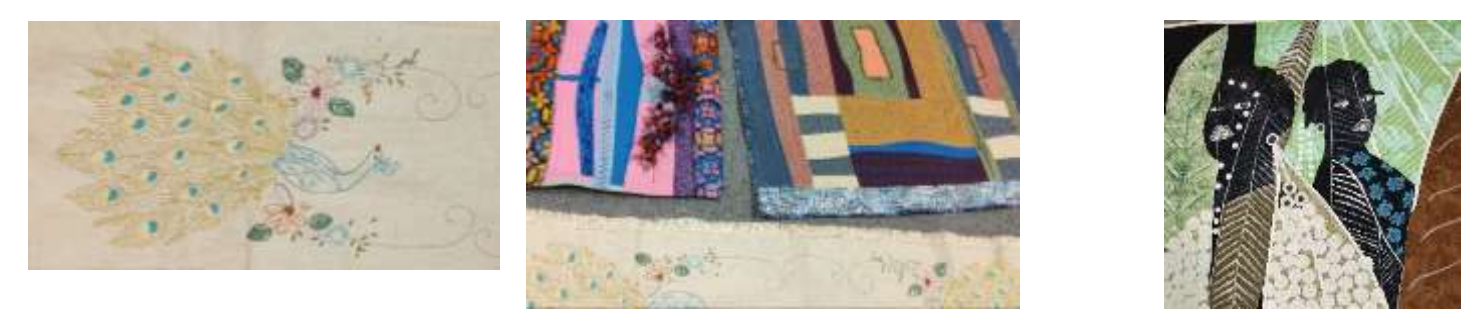
Work by Pat