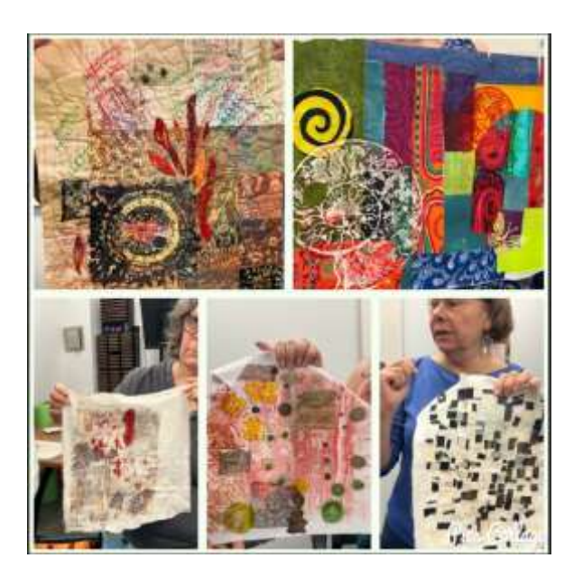
An Marshall archetypes