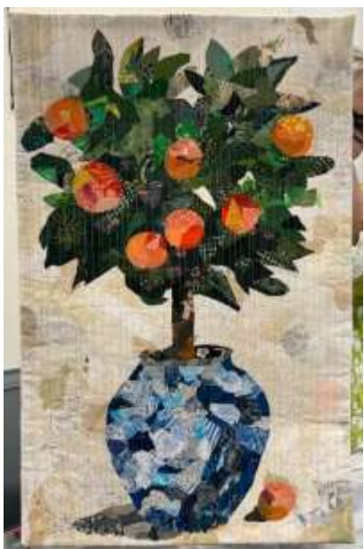
Deb Doer Orange Tree