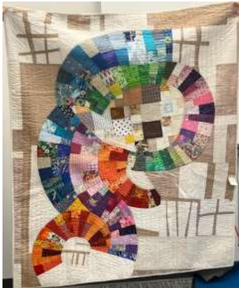
Work by Erica Dodge