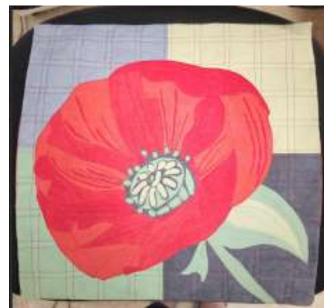
Above: Two works by Adele Reeves