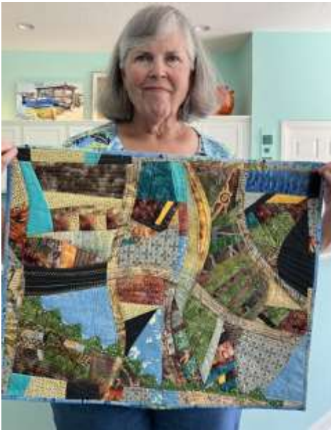
Below: Work by Kat