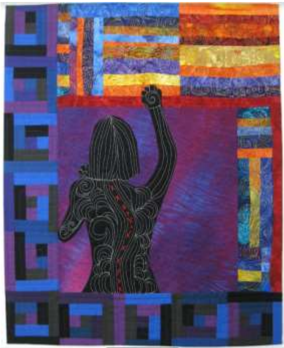
Reaching Beyond the Pain Dij Pacarro