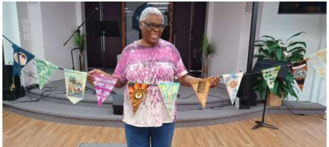
Angie's Stencil