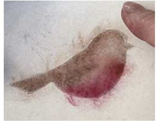
More image-making explorations from Pod 7