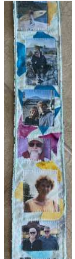
Work shared by Gail: Tree With Sunset , Happiness in a Vase , Avatar Woman , and a scroll created from family memory photos.