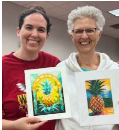
Kestrel and KC Grapes: Pineapples