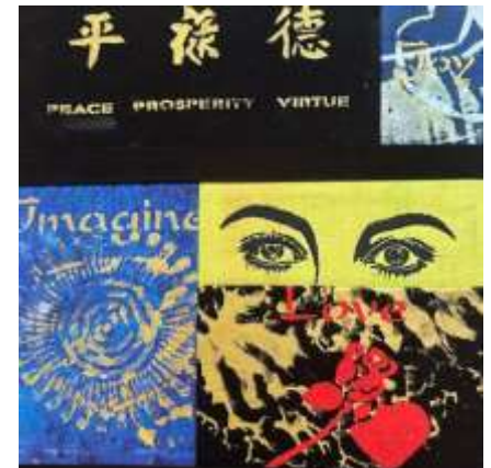
(Right) Perlie is teaching Gelli-Printing at Vero beach art club. Here's a sampling of what to do with your Gelli prints in a collage mounted on a 12x12. You can also use in prayer flags, cards, and quilts.