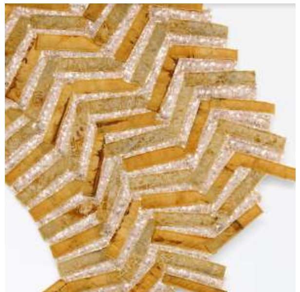
Exhibit to Launch During Art Basel Miami 2024

LIAIGRE Miami Showroom Features Innovative Textile Art by Regina Durante Jestrow "Non-Linear Path"