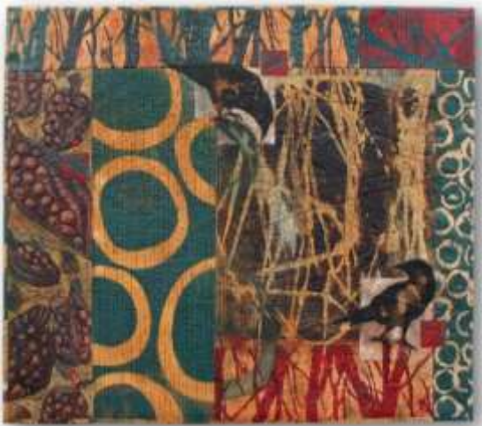
Water and Rust