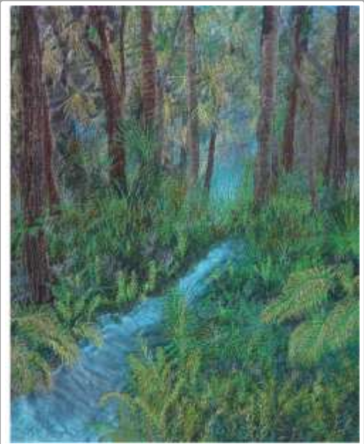
Above: Lily Pond 36" x 18"