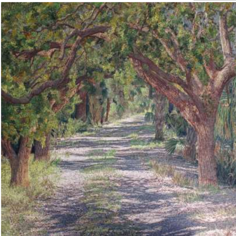
Left: Country Road 30" x 30"