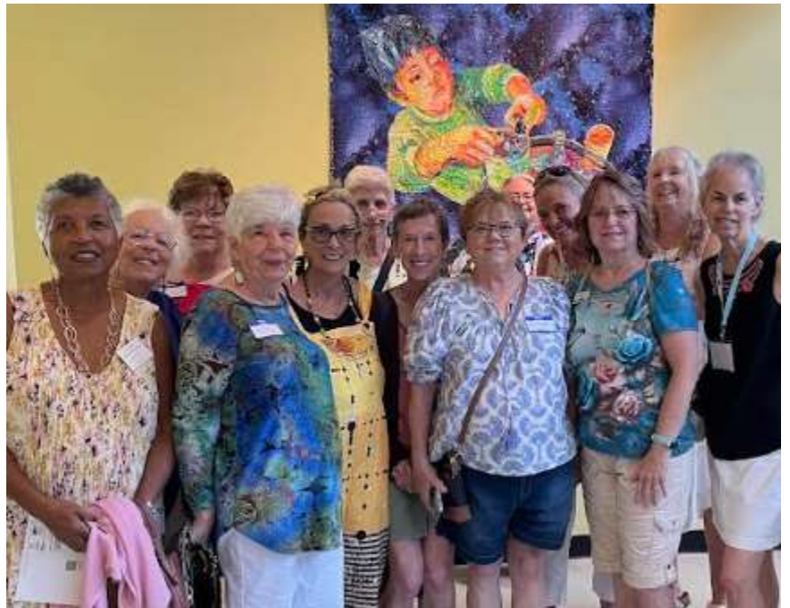
(Below) The happy group at Dunedin Fine Arts Center.