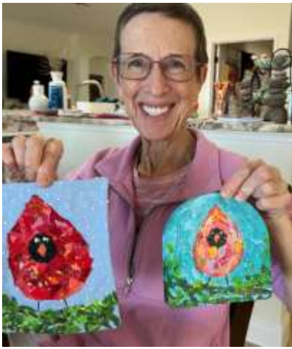
work by Sue Redhead