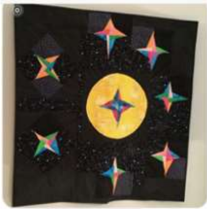
Twinkle twinkle little stars

Here are Sandy Naval's submissions for the South Florida Modern Quilt guild on March 5, 2025 in Pembroke Pines, Florida: Twinkle Twinkle Little Stars, Sailing