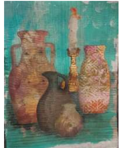
An Marshall Vessels collage