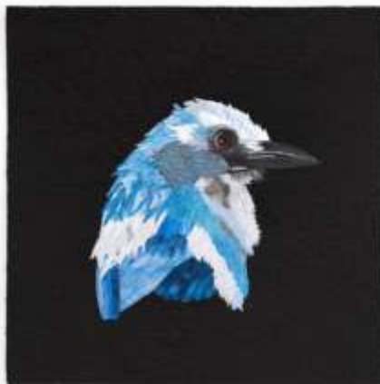
Florida Scrub Jay Midnight in the Garden Of Good and Evil