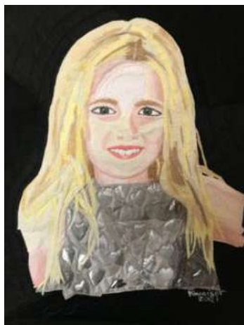
Granddaughter by Kay