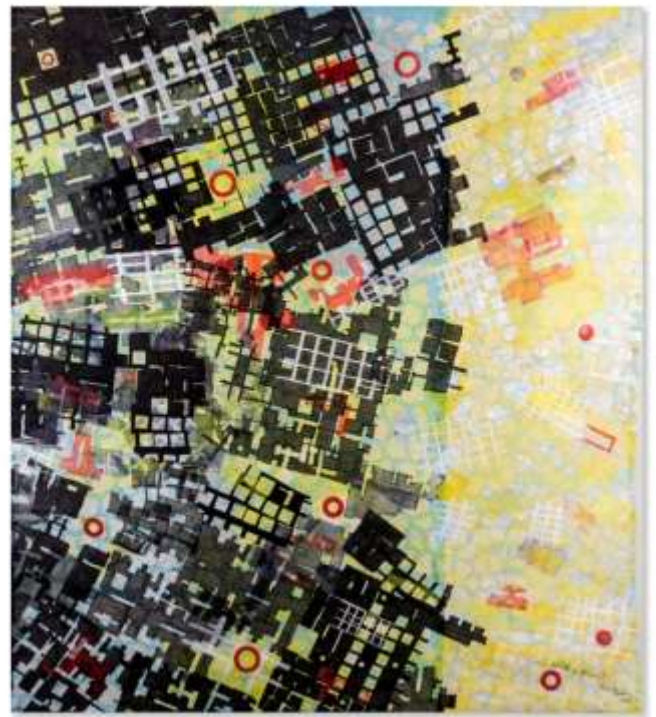
DEPARTURE © Valerie Goodwin