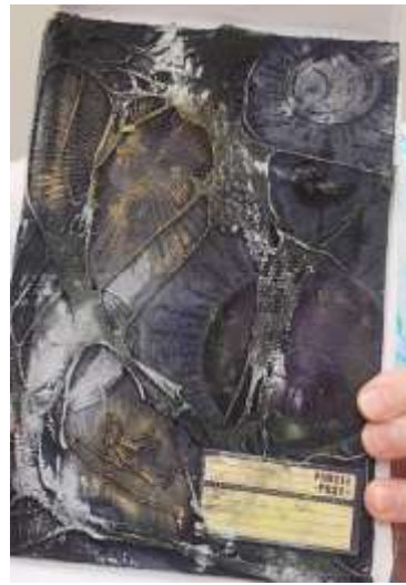
Emma Fleischer – Journal Cover and shoe-themed quilt